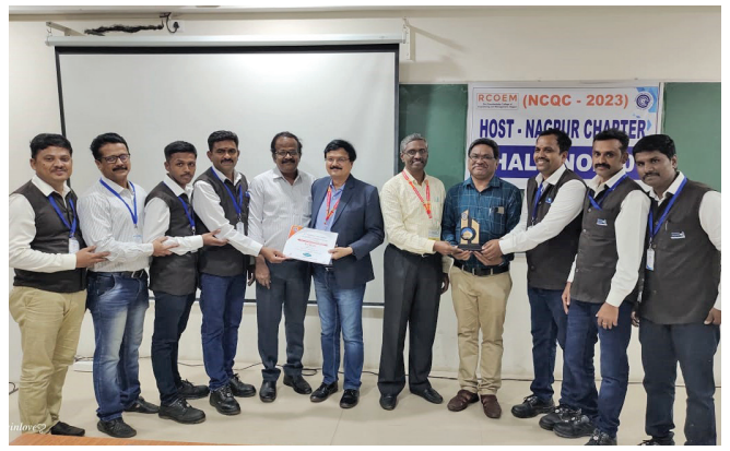
Our Mill Electrical Team along with Vice President - HR & TQM receiving the “Meritorious Winner Award - 2023” from National Quality Circle Forum of India at Nagpur for the Quality Concept presentation.