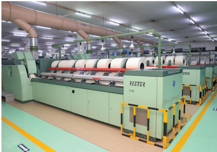
A view of new “Rieter E86” Comber Machine installed in our Unit at Rajapalayam.