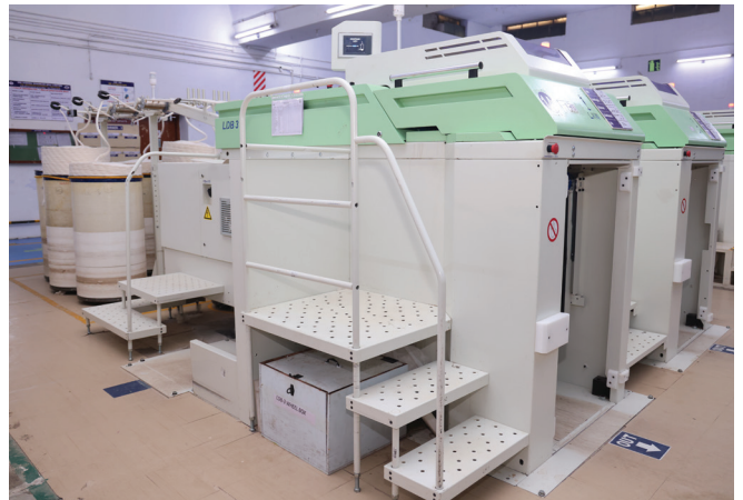
A view of new “LMW-LDB3” Draw Frame Machine installed in our Unit at Rajapalayam.