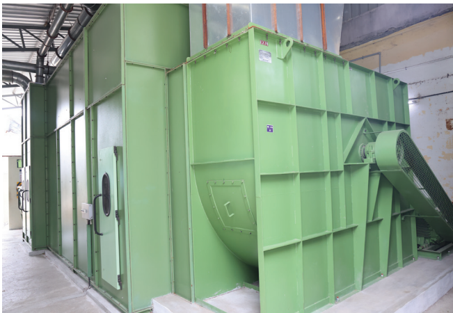
A view of new “VXL Systems” Ultra high efficiency centrifugal fan installed in our Unit at Rajapalayam.